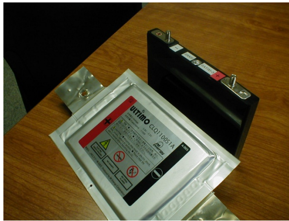
Fig.2. Photographs of the JSR Micro 1100F and 2300F devices