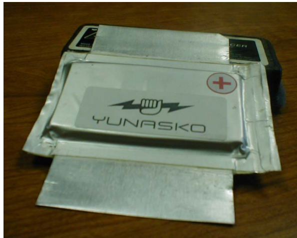
Fig.3. Photograph of the 5000F Yunasko hybrid Supercapacitor device